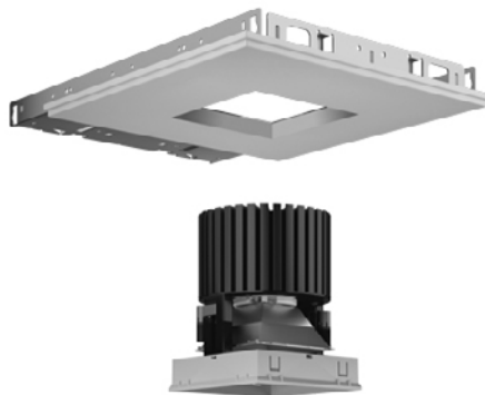
3. Install LED assembly.