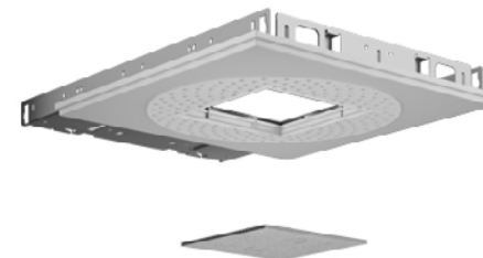
2. Insert protective cover (included). Apply joint compound over the mud frame.