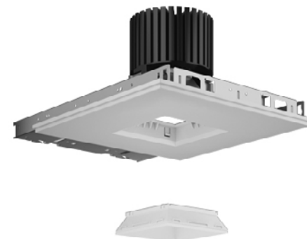
4. Install bezel.